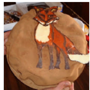
Wonderful to look at! Tasted as good as it looks!