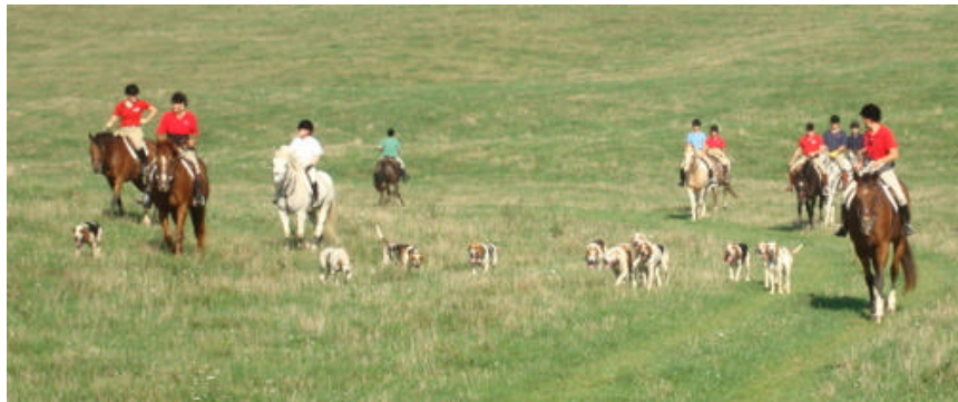
Back to Walnut Hill--Going Home after a long day

Remember Foxhunters: VA law requires foxhunters to carry a copy of their hunting license and current coggins on them while hunting. Most folks fold them up in a sandwich bag and put in the lining of their hardhat. You should also include any important medical info in case of an emergency. Wishing all a safe and exciting season with good runs and bountiful foxes. (ed)