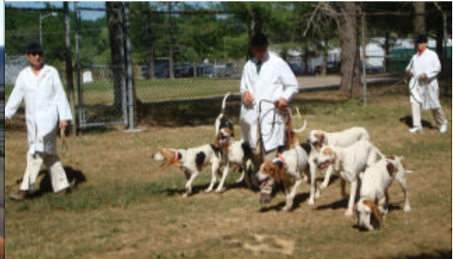
It all starts here, early morning beauty appointments for horses as the hounds prepare for their "show day"