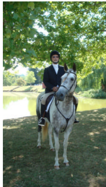
Berk Pemberton Glenmore on Parade Story and more pictures on page 4