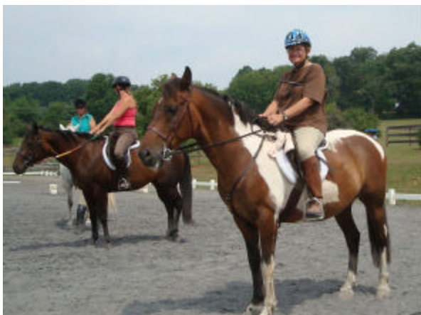
Let the Games Begin: Eager Participants at the Glenmore Clinic. Story on Page 5.