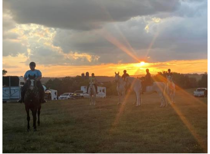
Riders prepare to set out for the ride.