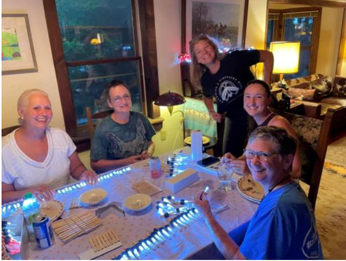
Volunteers manufacture the lights that will light the way.