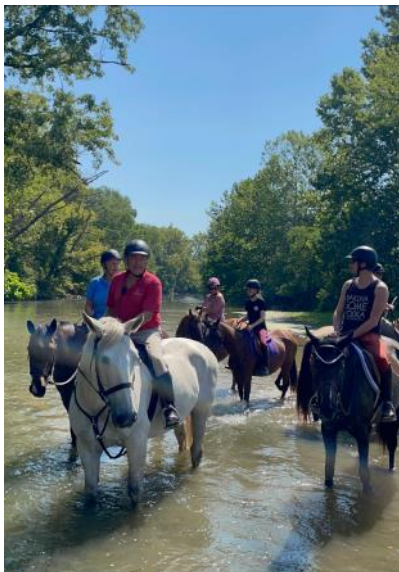
Horses and humans enjoy the river.