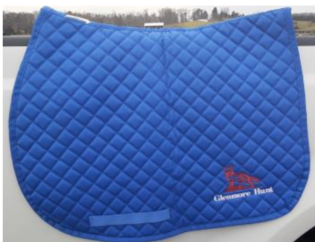
Square Pads—embroidered on both sides—$50

Royal Blue acceptable for Ratcatcher days.